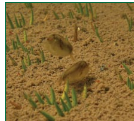
Giant forms of seed shrimps ( Ostracoda ) filter the tiny water column and graze on sediment and plant surfaces. These seed shrimps are almost 2 cm in diameter and they occur only in waters without fish as they are easy prey.

Aquatic animals occupying vernal pools are met with the same major challenges as the plants: the short duration of inundation after which follows a long period of desiccation (Bayly 1997). Probably one of the best adapted animals to cope with this challenge is the seed shrimp (Ostracoda). Seed shrimps are laterally flattened crustaceans protected by a two valves hinged on the back of the animal. They are among the first animals to appear when setting up a new aquarium and their eggs are extremely desiccation tolerant and present almost everywhere. In vernal pools, giant species of seed shrimps sometimes appear as there are no fish or other predators to prey on them. The vernal rock pools of Mukinbudin are no