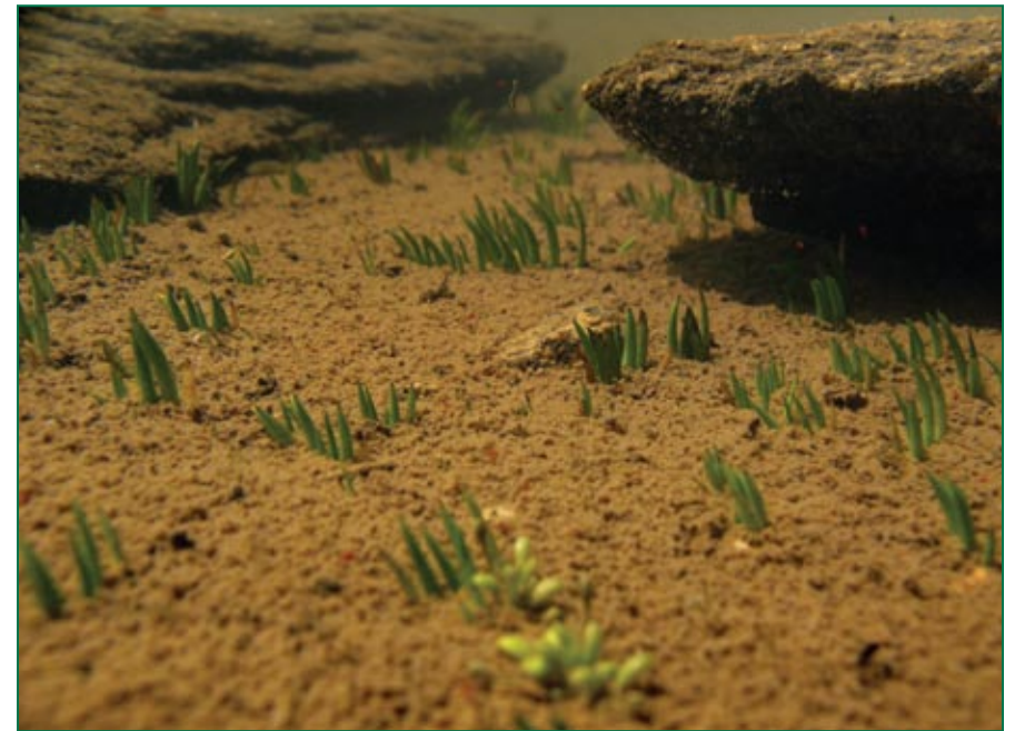
This pool is less than 10 cm deep and yet, the scattered rocks and the tiny Isoëtes australis form a beautiful aquascape.

water ( www.tropica.com ). The pools we visited were also characterized by having extremely soft water (from 10–90