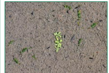
Flora occupying a 5 cm deep rock pool. A small patch of Glossostigma sp. grows in between several individuals of Isoetes australis .

leaved and emergent species all being represented in the flora. The flora is comprised of no less than 22 specialist species growing in no other form of temporary wetland (such as peat-lands and sump-lands) in Western Australia, along with many cosmopolitan species. Examples of the cosmopolitan flora include species from Aponogeton , Isoetes , Marsilea , Myriophyllum , Pilularia and non-native Callitriche and Cras-