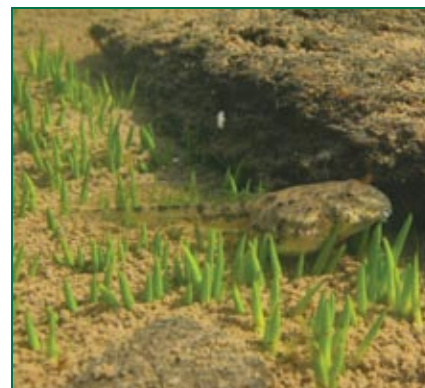
A tadpole of the burrowing frog rests among the Isoetes australis . The tadpoles sometimes appear in large number and then, they are able to graze down all aquatic vegetation. In this pool, however, the tadpoles can feed on algae and biofilms without grazing on Isoetes australis .

Western Australian vernal pools are host to a number of rare and threatened species including Myriophyllum lapidicola recorded on just a few rocks in the northern wheatbelt of Western Australia. This particular species is morphologically very different to the typical Myriophyllum with round floating leaves compared to the dissected filamentous seen in most common Myriophyllum species. Further, this particular species is restricted to a specific rare type of vernal rock pool. While most pools are flat and shallow M. lapidicola only occurs deeper pools that form on the steep slopes of granite inselburgs (an isolated rock hill, knob, ridge, or small mountain that rises abruptly from