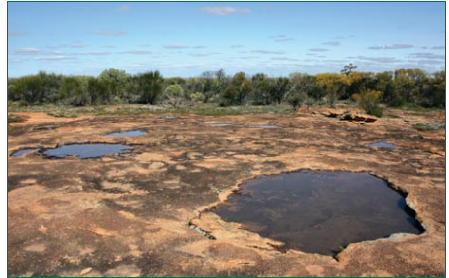
Vernal pools on granite outcrops near Mukinbudin, Western Australia. The pools are shallow and most are water-filled for less than 6 months. At first glance, they seem devoid of plants and animals but a closer look reveals a stunning aquascape in nature's own nano aquaria.

The small volume of water relative to the high plant biomass also results in huge diurnal fluctuations in pH and CO 2 . At night, when respiration processes produce large amounts of CO 2 , pH decreases and dissolved CO 2 builds