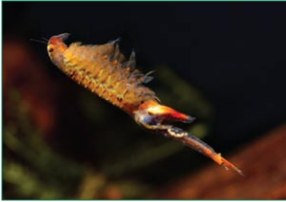
Fairy shrimps (Anostraca) are also common in the vernal rock pools. Eggs of both seed shrimps and fairy shrimps are highly tolerant to desiccation enabling them to colonize the vernal rock pools year after year.

exception; virtually all pools hold a decent population of giant seed shrimps feeding primarily on algae and ciliates.