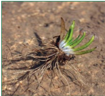
Isoetes australis has an odd morphology. It looks like a Chinese fan with its leaves arranged in a 2D fashion. The relative large root system forms symbiosis with fungi in order to extract the nutrients from the nutrient-poor sediment.

In contrast, Isoetes australis is only found in vernal pools in Australia. It exhibits CAM photosynthesis (Keeley 1983) and is annual. Species of Isoetes are also known to use sediment-derived CO 2 for photosynthesis but whether Isoetes australis also relies on sediment-derived CO 2 in addition to CAM