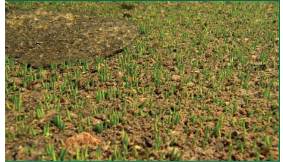
A dense carpet of Isoëtes australis . Some pools host almost a monoculture of Isoëtes australis whereas others allow coexistence of the most common plants found in the vernal rock pools.

Glossostigma elatinoides , which also comes from Australia, is already being