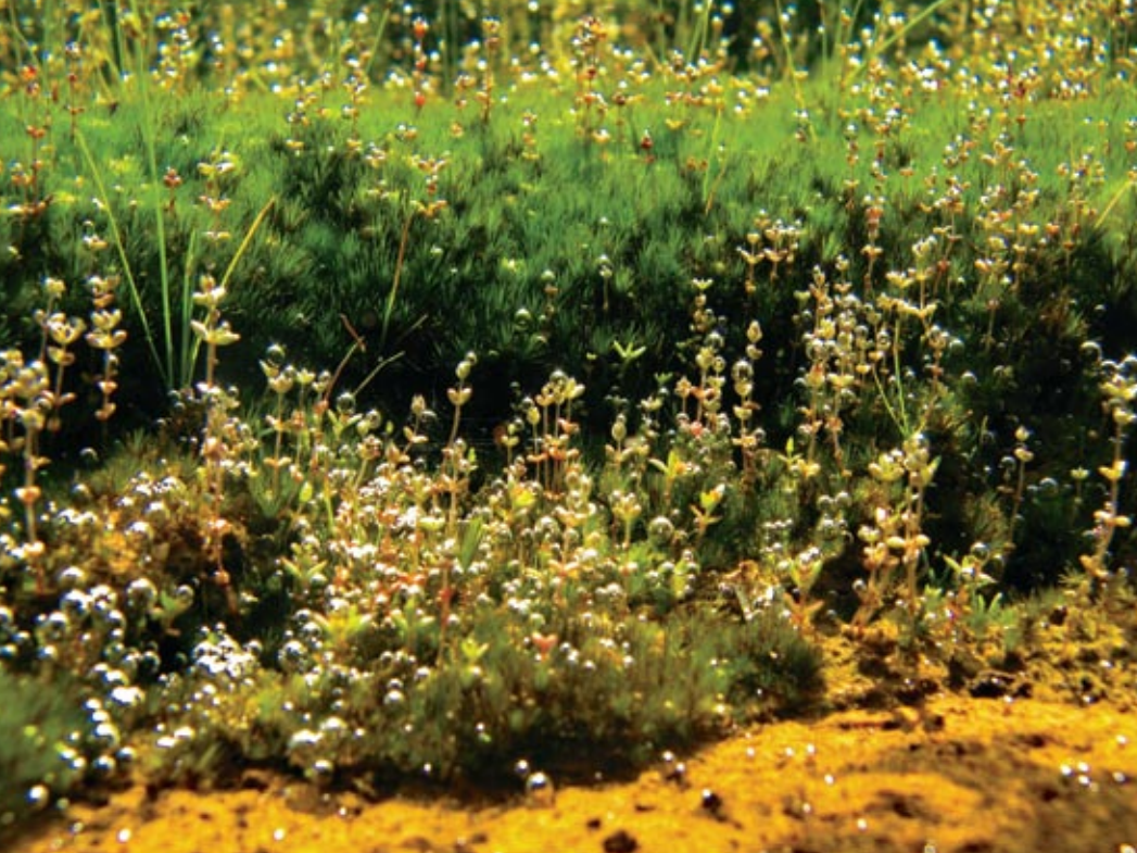
This 8 cm deep pool reveals a spectacular aquascape showing natural bubble formation on species of mosses and Crassula natans following intense photosynthesis.

μS/cm) since they are 100% rain-fed and sit on granite with no alkalinity at all. But we do not know if the species found here are as demanding as Glossostigma elatinoides .